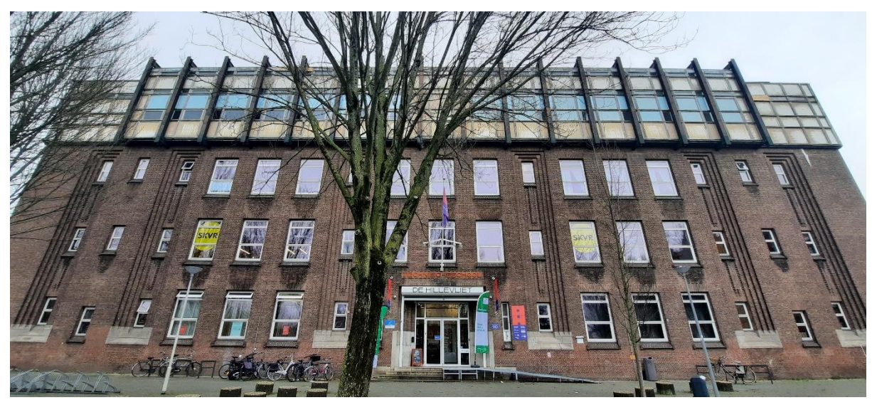
Figure 1. De Hillevliet.